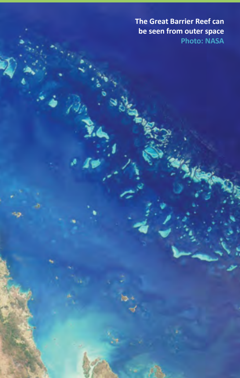
The Great Barrier Reef can be seen from outer space

The Great Barrier Reef supports a diversity of life, including vulnerable or endangered species.