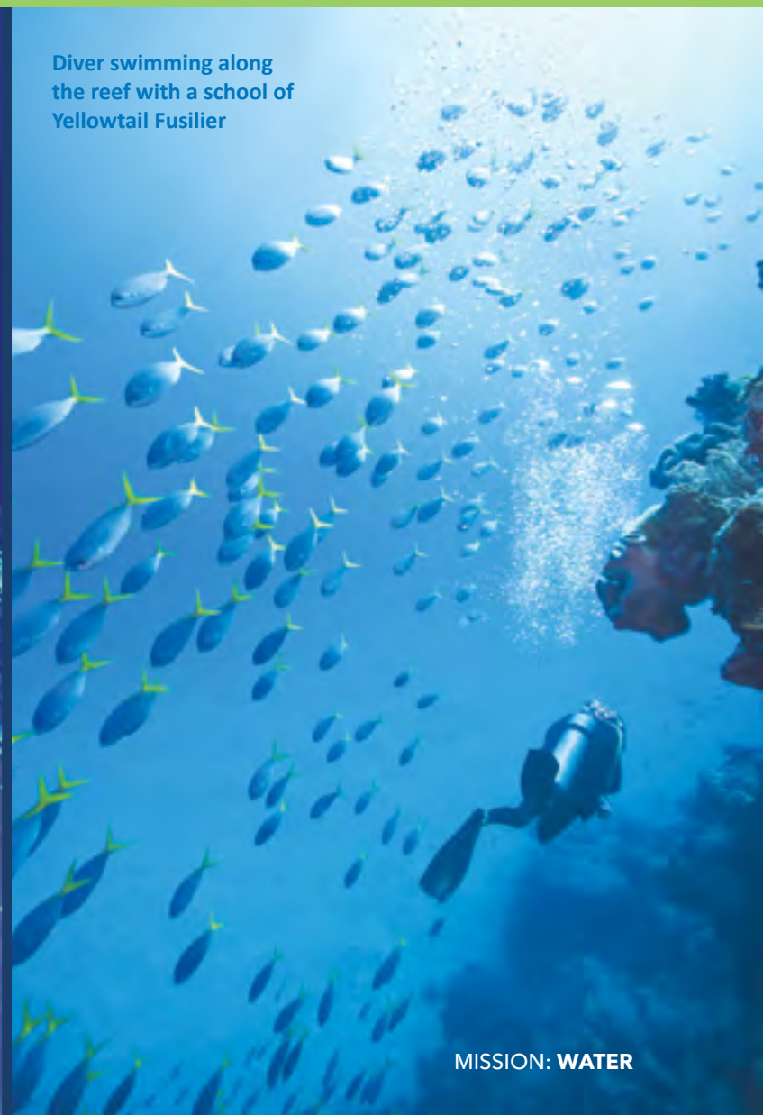
Diver swimming along the reef with a school of Yellowtail Fusilier