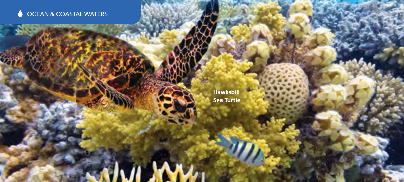
Hawksbill Sea Turtle

The Great Barrier Reef supports a diversity of life, including vulnerable or endangered species.